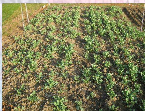
Untreated 76% of target establishment