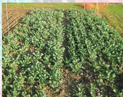
treated with Modesto 91% of target establishment